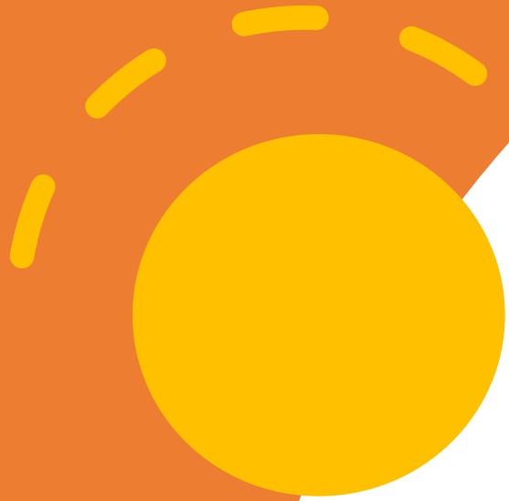
Table talk time...

Please take an index card on your table for an activity